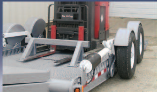
The Lo Riser can be equipped with optional Star Traction Flooring and a removable stop / brace.