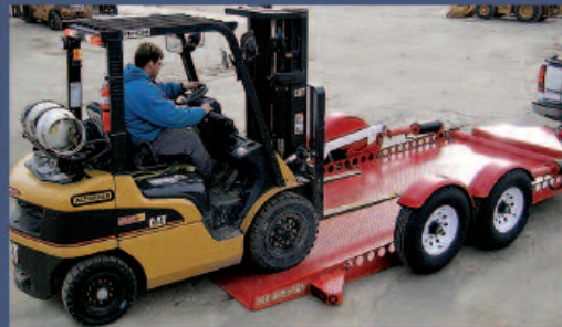
A flip of a switch hydraulically lowers the deck to ground height to allow fast, drive-on access.