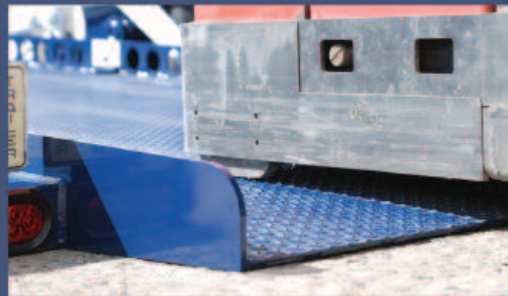
When lowered, the Lo Riser allows a minimum 4° and 5° angle ideal for low ground clearance or reduced gradeability vehicles.